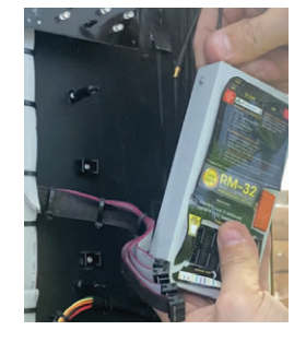
NOTE: Controller may look different depending on age.